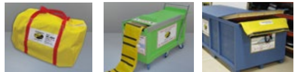
Deployment methods for Water-Gate